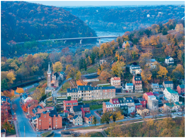
Harper's Ferry, WV